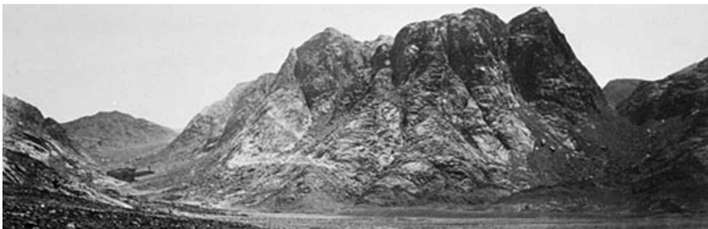
Horeb, the mountain of God at Sinai, was not just the location where God entered into covenant with Israel, it was The Mountain of God, where God revealed Himself.

At Horeb, whilst lodging in a cave 12 , the Word of the Lord came to Elijah. Elijah's conversation with God, at Horeb, is reminiscent of that of Moses. Not only were these two men prophets of the LORD, they were both concerned with God's covenant with Israel, and the unfaithfulness of the people.