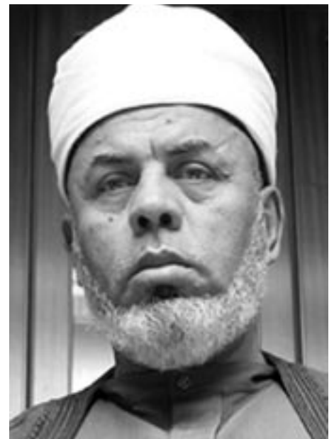
Controversial Sheikh al-Hilali, grand mufti of Australia. See next page for Special Report—Not so "al-Hilarious".

28 November 2006, The Washington Times reports, "Muslim religious leaders removed from a Minneapolis flight last week exhibited behaviour associated with a security probe by terrorists and were not merely engaged in prayers, according to witnesses, police reports and aviation security officials." Furthermore, the article stated, "Passengers and flight attendants told law-enforcement officials the Imams switched from their assigned seats to a pattern associated with the September 11 terrorist attacks and also found in probes of U.S. security since the attacks." In their defence the Imams said they "were merely praying before the 6.30pm flight on November 20, and yesterday led a protest by prayer with other religious leaders at the airline's ticket counter at Ronald Reagan Washington National Airport". Strange that they had to change seats to pray? "Two in the front row first-class, two in the middle of the plane on the exit aisle and two in the rear of the cabin". 17 One might suggest that such action was intentional, just as provoking the expected response was; all for the purpose of getting profiling banned on US flights. Other reported unusual actions by the Imams was, "The Imams" also claimed "two first-class seats", saying "their tickets were upgraded.