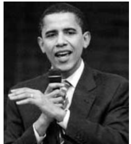
Senator Barack Obama, D-Ill., not Osama bin Laden

Osama (not Obama) allegedly still can't be found, which is another confusion to us all. Maybe bin Laden would resent being taken for Barack Obama and would relish the opportunity to sue CNN (or worse) if anyone would give him a chance. It's not the first time the two have been confused in the public arena. Go to the above link and listen to a parody song about it all under the heading—Click here to listen to the spoof.