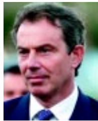
P. M. Tony Blair

the clock of science back to the Middle Ages will not stop with biology.’ In the humanist furore that was directed against a British Christian school, AiG and Bible-believing Chris-