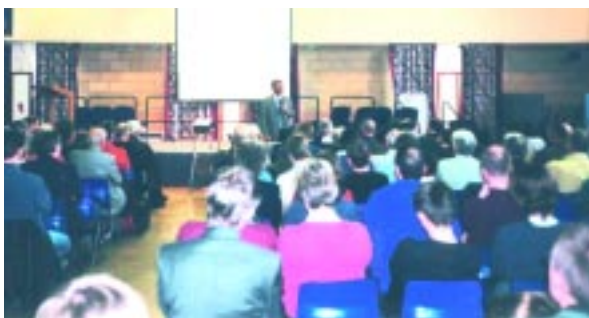
The meeting at Gateshead school which caused all the commotion

Church leaders also became involved. The Bishop of Oxford was heard on radio and quoted in the newspapers with statements such as: 'This attempt to see the Book of Genesis as a rival to scientific truth stops people taking the Bible seriously. Biblical literalism brings not only the Bible but Christianity itself into disrepute.' Wake up, Bishop, sir! People throughout